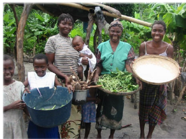
Participants having home gardens increased from 9% to 28%.