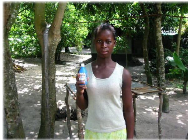
Participants having safe drinking water increased from 15% to 99%.