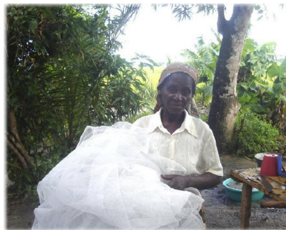
Participants sleeping under treated mosquito nets increased from 47% to 70%.