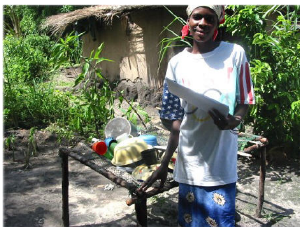
Participants having a place to keep their dishes off the floor increased from 48% to 95%.