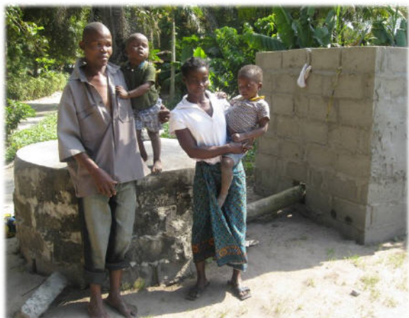
Participants having latrines increased from 46% to 86%.