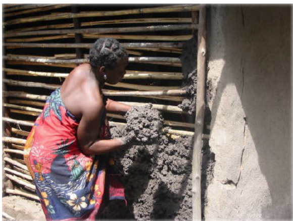
Participants having safe strong walls for their home increased from 46% to 95%.